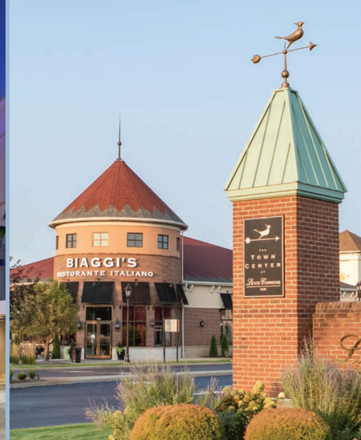
The Town Center at Levis Commons