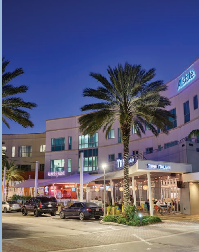
Promenade at Coconut Creek