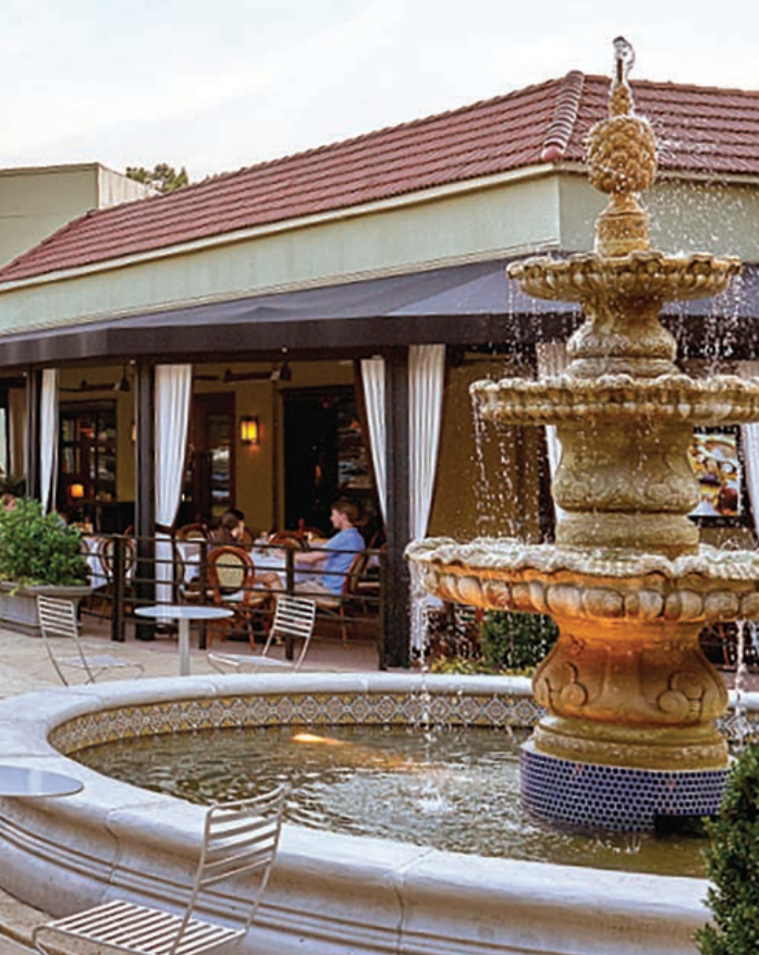
Specialty Shops SouthPark