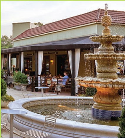
Specialty Shops SouthPark