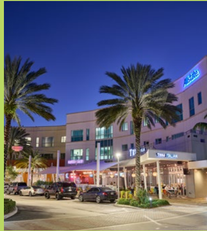
Promenade at Coconut Creek