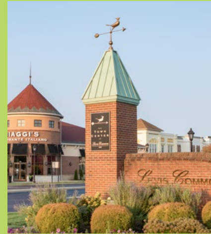
The Town Center at Levis Commons

Hill Partners, Inc., founded in 1983, is a commercial real estate firm specializing in providing innovative retail and mixed-use development solutions. The company concentrates on three basic divisions: Project Conceptualization, which includes feasibility studies, strategic planning, merchandising and market research; Project Implementation, which includes acquisitions, design management, development/construction management and merchant recruitment; and Property/Asset Management, including operations, tenant relations, consumer marketing and accounting.